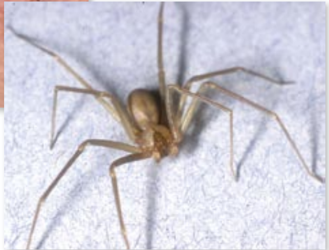
In Canada, hobo spiders (top) are found only in southern British Columbia. Contrary to popular belief, they are unlikely to bite and have never been reliably implicated in dermonecrotic lesions.