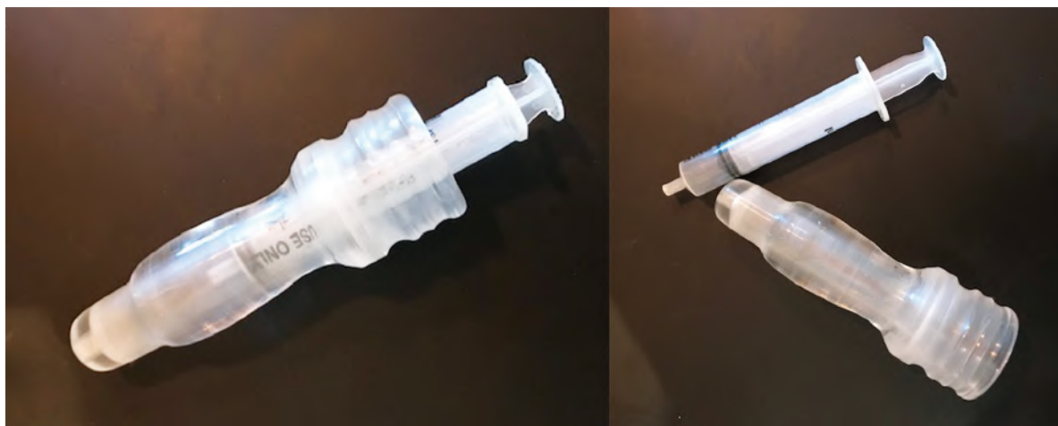
Figure 1. Homemade insemination kit

a cervical cup is placed into the vagina, and the syringe containing semen is attached to the stem of the cup, such that the semen can be directly introduced. 15 For optimal chance of success, the woman should lie down for 15 to 20 minutes after intravaginal insemination. 16