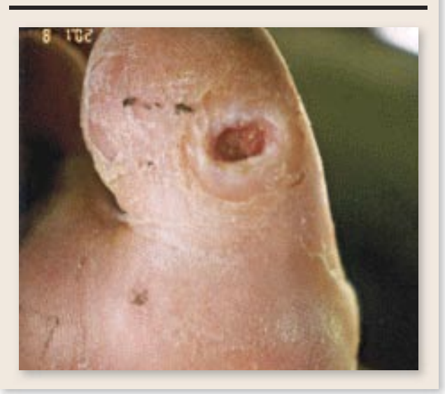
Figure 1. Lesion on right big toe

lesion's base extended to bone ( Figure 1 ). The toe was markedly swollen, and a purulent, foul-smelling discharge seeped from the ulcer. There was no associated forefoot swelling, erythema, fluctuation, or articuler crepitus, and no groin lymphadenopathy. No foot or ankle deformities were observed. Mr H.S.'s posterior pulses were easily palpable, but neurologic assessment found he had no sensation on monofilament testing in a symmetrical stocking distribution ( Figure 2 ), and both ankle reflexes were absent.