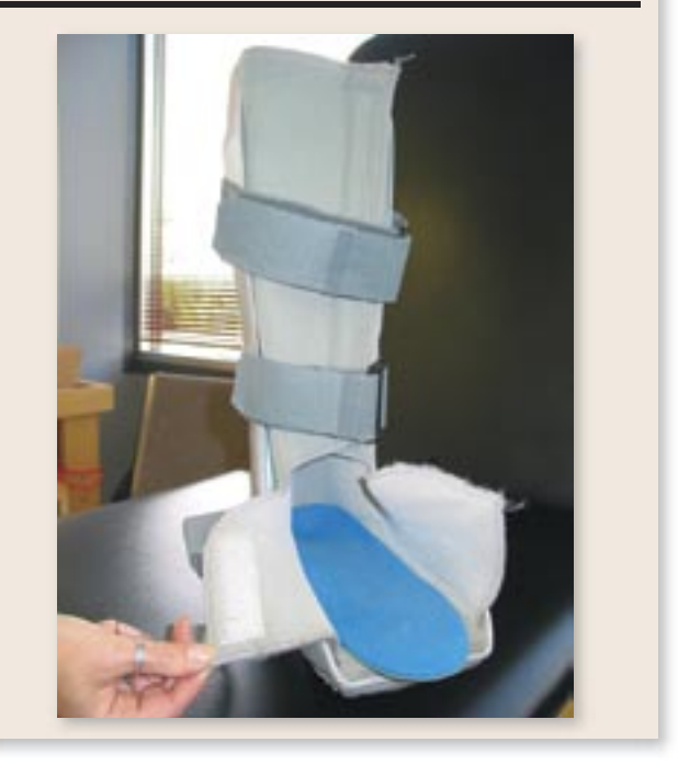
Figure 5. Air Cast<sup>™</sup> walking splint with total contact insert

Disseminate advice to other family members and health care professionals involved in the care of your patient.