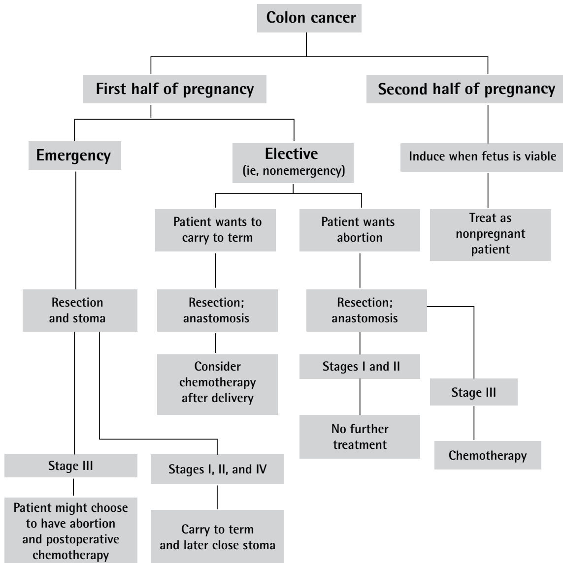
Figure 1. Management of colon cancer in pregnancy

Adapted from Walsh and Fazio. 9 Used with permission.