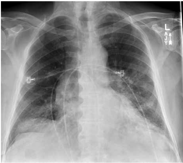
Figure 2. Patient's chest radiograph 9 months later shows new right perihilar nodular bronchovascular thickening compared with the first chest radiograph (Figure 1), with continued right basal opacity and slightly worsened left perihilar opacity